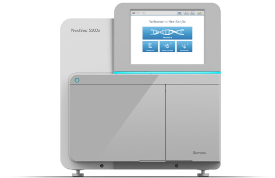
Figure 1: The NextSeq 550Dx Instrument—Leveraging SBS chemistry and user-friendly, regulated workflows, the NextSeq 550Dx Instrument delivers high-quality results for clinical and research applications.