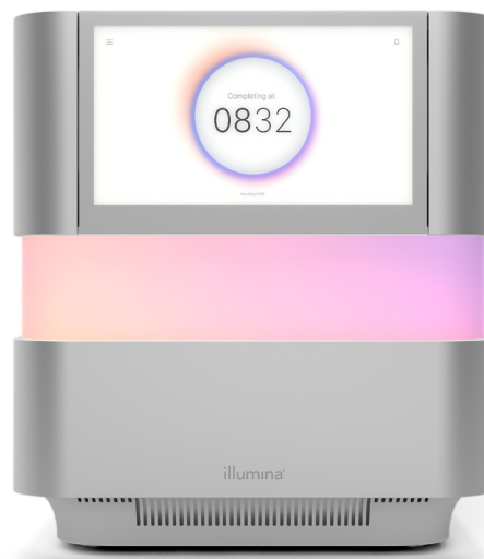
Figure 1: The NextSeq 2000 Sequencing System —The latest NGS system from Illumina offers innovative design features, advanced chemistry, simplified bioinformatics, and an intuitive workflow that enable the widest range of applications on a benchtop sequencing system.