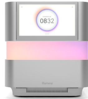
Figure 1: NextSeq 1000 and NextSeq 2000 Sequencing Systems—The NextSeq 1000 and NextSeq 2000 systems harness optimized SBS chemistry to streamline sequencing workflows.