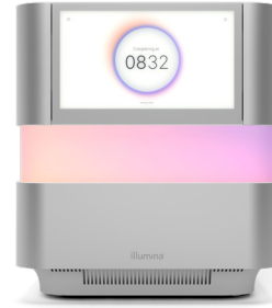
Figure 2: NextSeq 1000 and NextSeq 2000 Sequencing Systems—The NextSeq 1000 and NextSeq 2000 systems harness the latest advances in SBS chemistry to streamline sequencing workflows.

The NextSeq 1000 and NextSeq 2000 exome sequencing solution simplifies exome sequencing, enabling researchers to maximize their productivity. It begins with library preparation and exome enrichment using