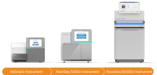
Figure 2: Optimized performance across validated platforms—These FDA-regulated, CE-marked IVD instruments offer user-friendly interfaces, enhanced security, and high-quality results for clinical applications.

Local Run Manager in Dx mode offers a fully integrated onboard analysis option accessed through a user-friendly touch screen interface on the MiSeqDx Instruments. The software supports sequence run planning and tracking of libraries and runs with audit trails. Local Run Manager automatically starts primary analysis (FASTQ generation from base calls) after a sequencing run is completed with the GenerateFASTQ Dx Module.