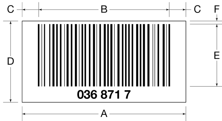
Figure 2 Barcode Dimensions