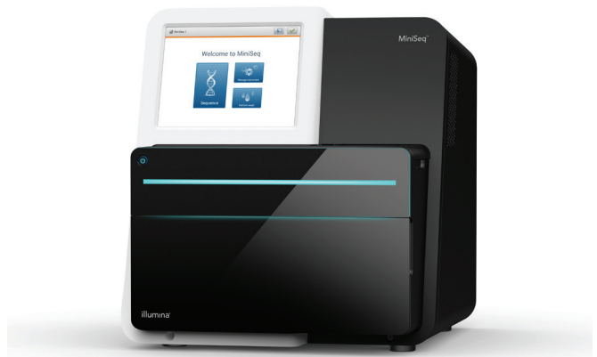
Figure 1: The MiniSeq System—By harnessing advances in SBS chemistry and simple, streamlined workflows, the MiniSeq System delivers a powerful, easy-to-use, library-to-results solution.

The MiniSeq System (Figure 1) delivers the quality and reliability of Illumina next-generation sequencing (NGS) technology in a powerful, accessible benchtop sequencer with a small footprint. This small, robust system turns a broad range of NGS methods into approachable, easy-to-use research tools, enabling researchers to take control of their sequencing projects. With the MiniSeq System, there is no need to wait to batch samples for sequencing on a high-throughput instrument; researchers can sequence on demand. It circumvents the iterative, time-consuming testing of Sanger sequencing and qPCR to allow for interrogation of individual genes to entire pathways with full-gene coverage. Laboratories of any size can perform a range of sequencing methods to deliver results and advance their research.