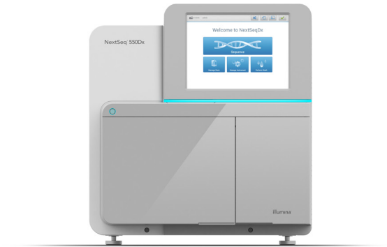
Figure 1: The NextSeq 550Dx Instrument—Leveraging SBS chemistry and user-friendly, regulated workflows, the NextSeq 550Dx Instrument delivers high-quality results for clinical and research applications.